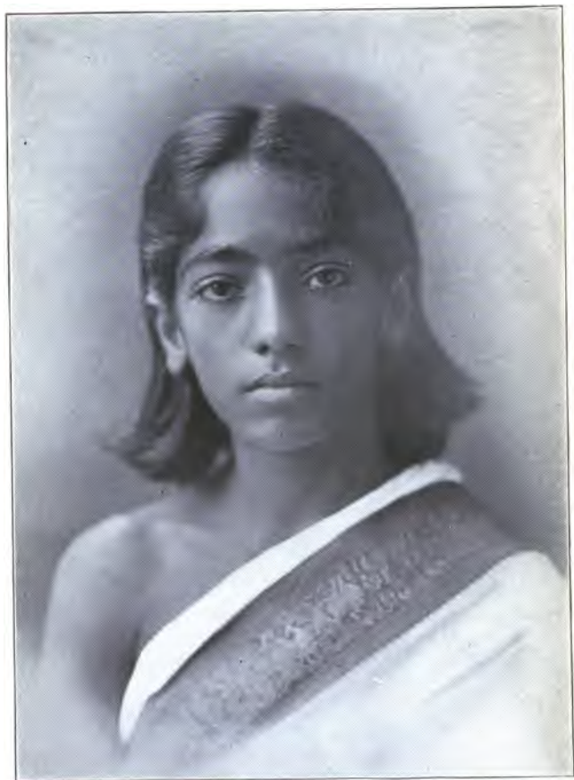
J. Krishnamurti Alcyone